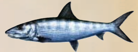
BONEFISH { Spookus easys }