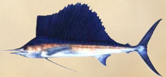
SAILFISH { Leapus Maximus }