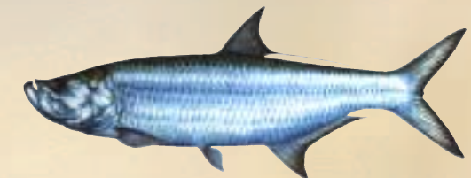
TARPON { Butkickus fishus }