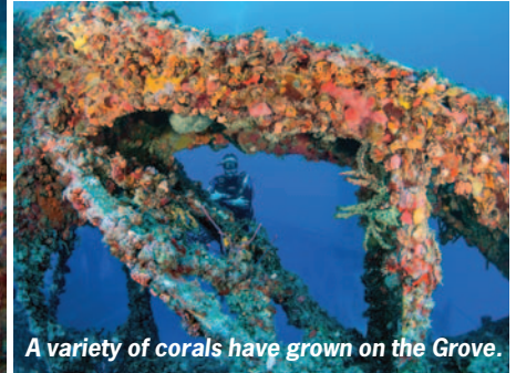
A variety of corals have grown on the Grove.