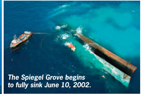
The Spiegel Grove begins to fully sink June 10, 2002.