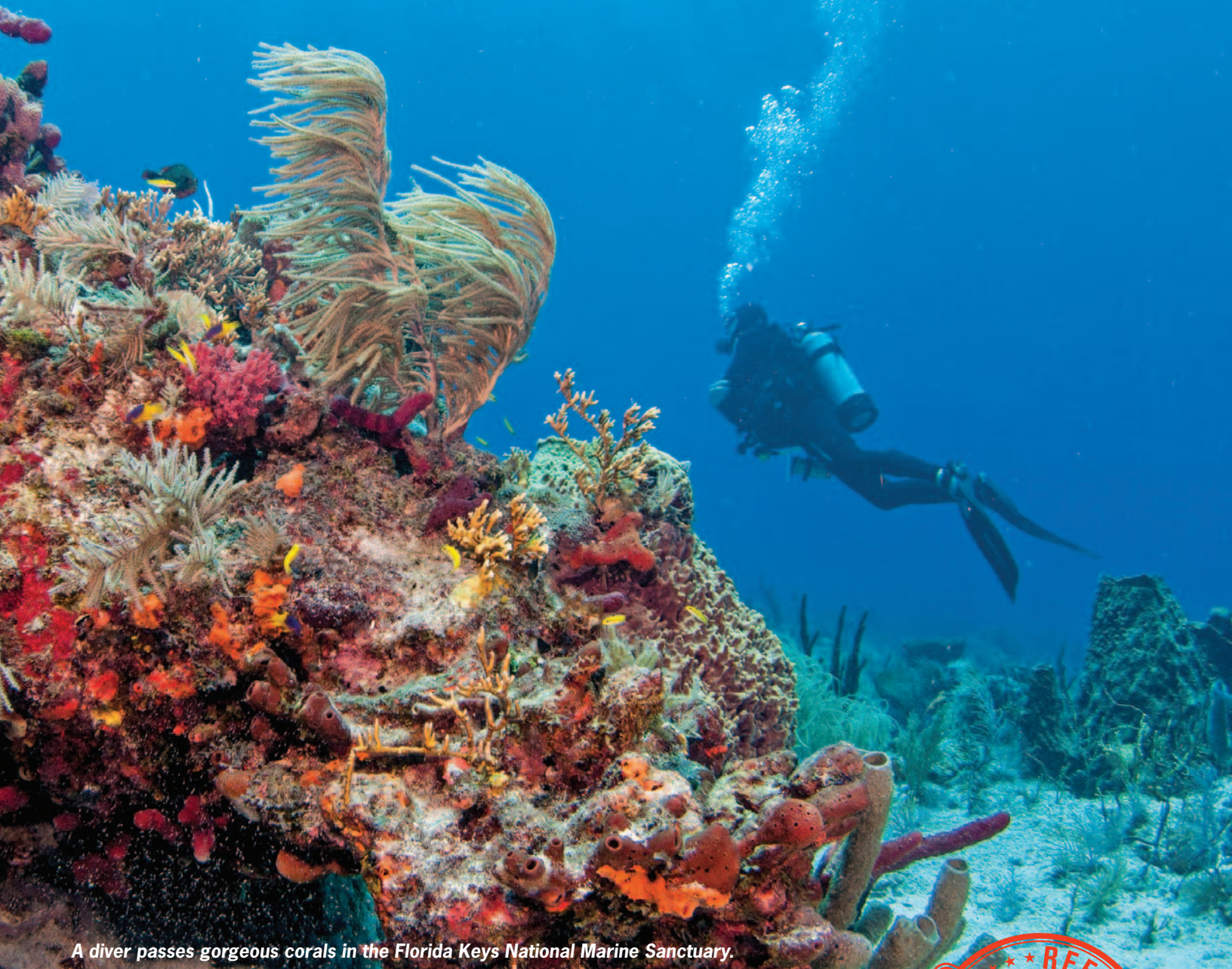
A diver passes gorgeous corals in the Florida Keys National Marine Sanctuary.

B eginners, seasoned divers and snorkelers can become Reef Explorers. After visitors arrive in the Florida Keys, they can ask any dive or snorkel operator for a complimentary souvenir Reef Explorer Guide.