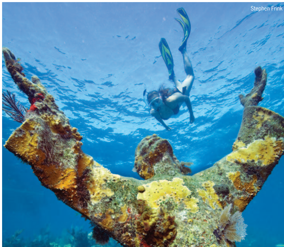
A snorkeler descends to examine the famous "Christ of the Deep" statue off Key Largo.

Among Marathon's notable patch reefs and spur-and-groove formations is Sombrero Reef, marked by a large