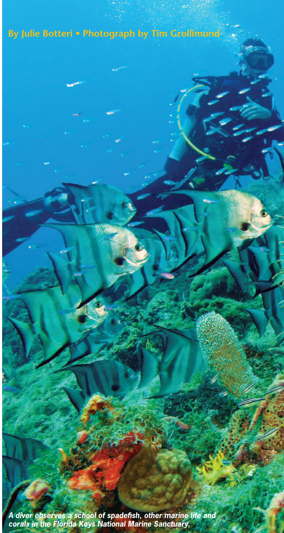
A diver observes a school of spadefish, other marine life and corals in the Florida Keys National Marine Sanctuary.