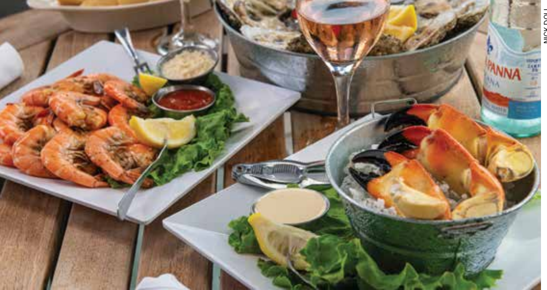
Key West pink shrimp and fresh Florida Keys stone crab claws are delectable favorites on any dining table.

Spiny clawless Florida lobsters, served up steamed or broiled with drawn butter or refreshingly cold, are another favorite.