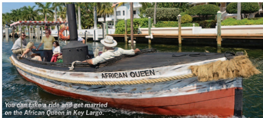
You can take a ride and get married on the African Queen in Key Largo.

In the Marathon area, couples with a love for marine mammals can marry at Dolphin Research Center on Grassy Key. During a "Private