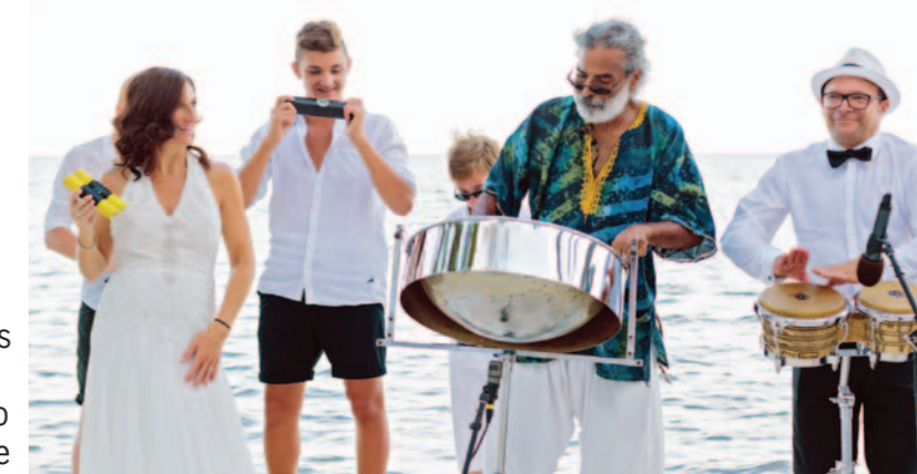
A bride and a guest get into the music with a steel drummer.