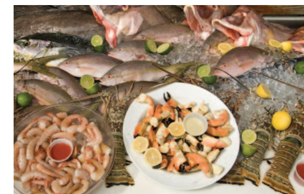
A showcase of indigenous Florida Keys seafood.

Dessert trends include melt-in-your-mouth Key lime creations and metallic-gold cakes. Colorful desserts include hand-rolled, ganache-filled Key lime “cupcake sushi” cakes. Mini Key lime tarts are also popular, styled after the island chain’s famous signature Key lime pie.