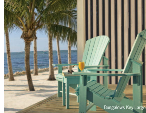
Bungalows Key Largo rooms have beautiful bayside views.

In Islamorada, the 214-room, 27-acre oceanfront Cheeca Lodge & Spa has several pools, 4,600 square feet of versatile space and a Tahitian-style Spa Island. Its