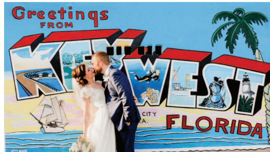
Key West is a wedding photographer's dream for natural and manmade photo backdrops.

Key West, the southernmost city in the continental United States, is just 159 miles southwest of Miami and 90 miles from Cuba. Driving