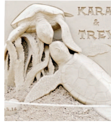
A sand artist created this custom sculpture of two loving sea turtles for a couple's wedding in the Florida Keys.